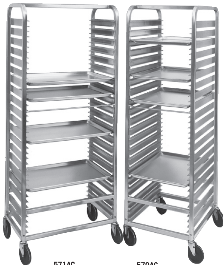
571AC Side Load