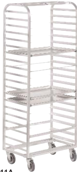
411A Side Load