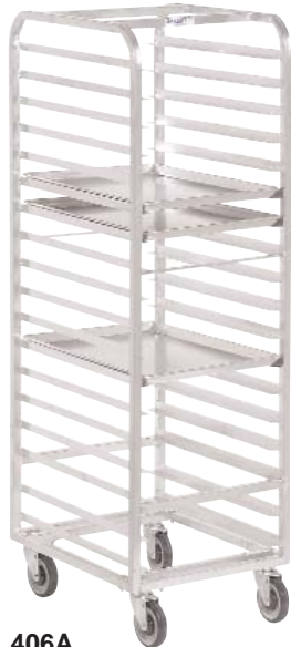
406A Front Load